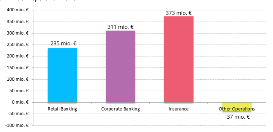
Chart 2: Pre-tax profit by business segments of OPF in 2019

See Chart 2 for the contributions of each business segment to OPF's pre-tax profit of €882 million in 2019.